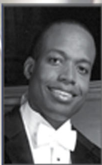
Organ virtuoso and Director of Music at St. John's.