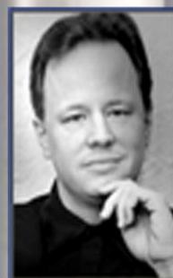
World-renowned Canadian organist/ improviser.